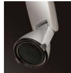
Honeycomb Louvre Attachment Suffix /HDL