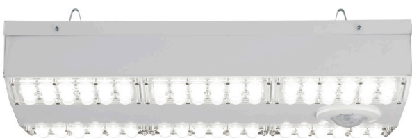
10° Wide Aisle Version